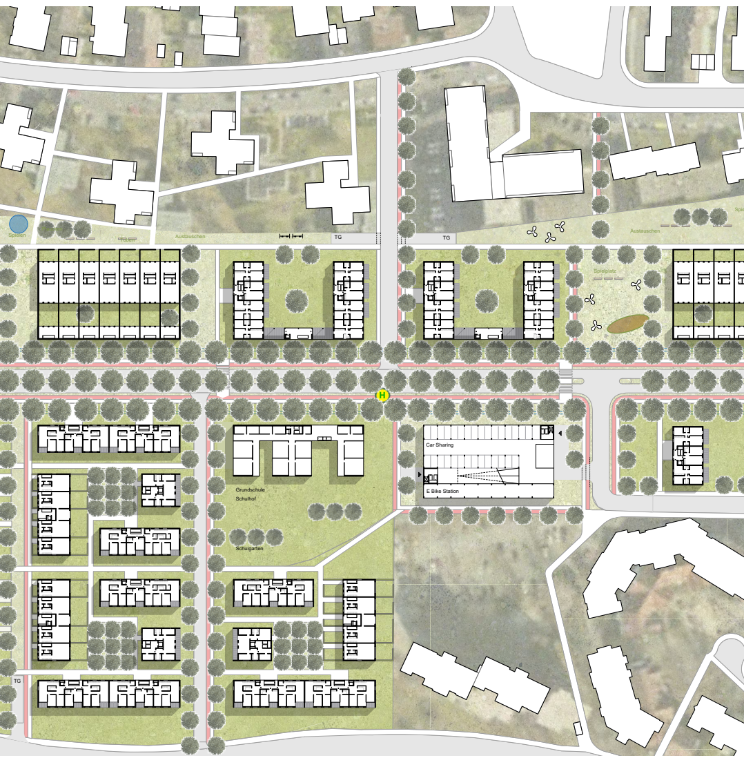
VERTIEFUNGEN M 1:500