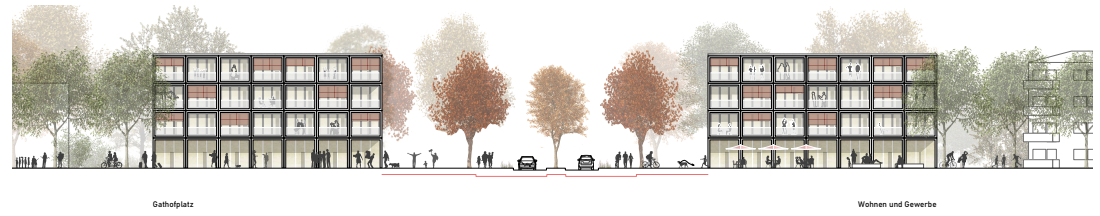
Gasthofplatz Wohnen + Gewerbe Wohnen + Gewerbe